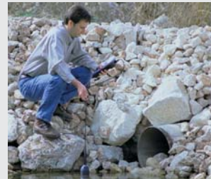
Portable online-measurement of water quality at a waste-water outlet