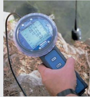
The Quanta Field Display – displays readings of up to 5 parameters simultaneously

transmission etc.) as well as the potential for alarm functionality to alert users to possible quality events.