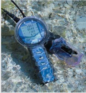
The Quanta Field Display – waterproof (IP 67/NEMA 6), robust, compact, easy to use, simple menu-driven operation

The Quanta Measuring System has been developed for the cost effective and accurate monitoring of water quality