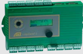
Station-Manager OTT LogoSens 2

Quanta Multi-Parameter Probe – OTT LogoSens 2: the ideal combination for a stationary measuring site for the monitoring of water level and water quality.