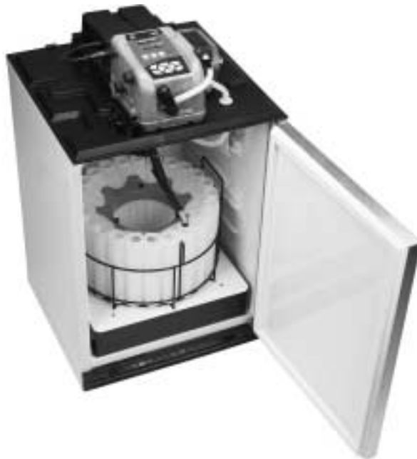
The Hach Sigma SD900 Indoor Refrigerated Sampler is easy to set up and program, delivering reliable results and reduced maintenance.

The optional SDI-12 communication interface can connect to devices such as Hydrolab MS5 and DS5 water quality sensors to collect data that can be used as triggers in setpoint sampling applications.