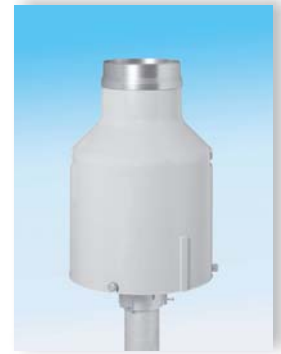
OTT Pluvio 2 400