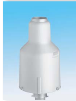
OTT Pluvio 2 200

Both versions are optionally available with ring heating.